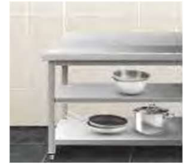
Stainless Steel Furniture