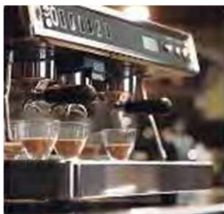
Café & Ice Cream