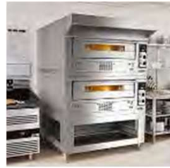
Pizza & Grill