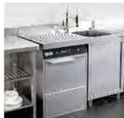
Rinsing & Cleaning